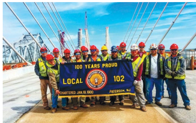
Local 102 members display IBEW banner during construction of Goethals Bridge.