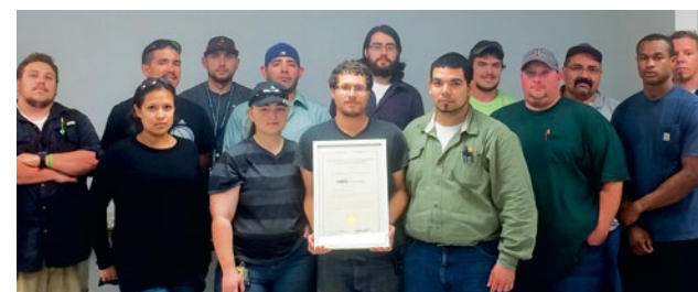
Local 60 RENEW committee displays chapter charter.