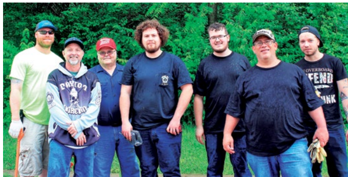
IBEW Local 82 volunteers participated in community service project at campus of the Dayton Veterans Affairs Medical Center in Ohio.