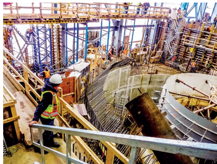
Winnipeg, Manitoba, Local 2034 members, like those working for Manitoba Hydro at the Wuskwatim Generating Station, have been squeezed by the provincial government. Now they're fighting back.