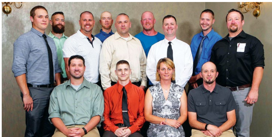
Local 306 congratulates the local's newest journeyman wiremen, class of 2017 graduates.