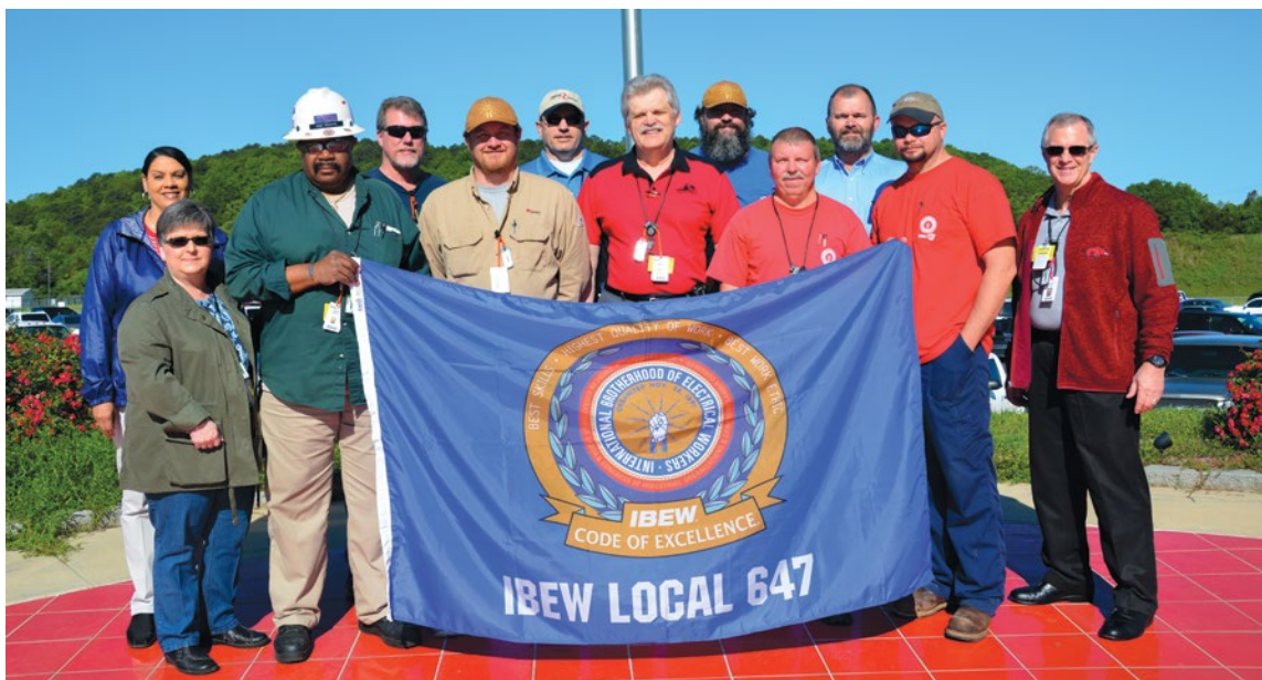
Members of Little Rock, Ark., Local 647 and company officials from Entergy's Arkansas Nuclear One plant raised the IBEW's first Code of Excellence Flag at the end of April.

In 2015, it was safe to say things at Entergy's Arkansas Nuclear One in Russellville, Ark., were not going well.