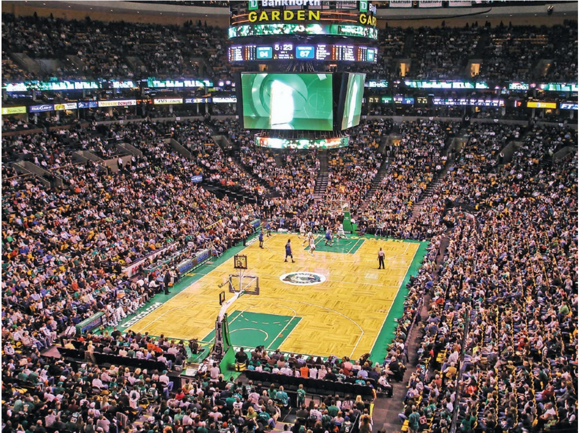
The contracts cover major league football, hockey, soccer, baseball and basketball. Local 1228 is also signing contracts for colleges and regional teams.