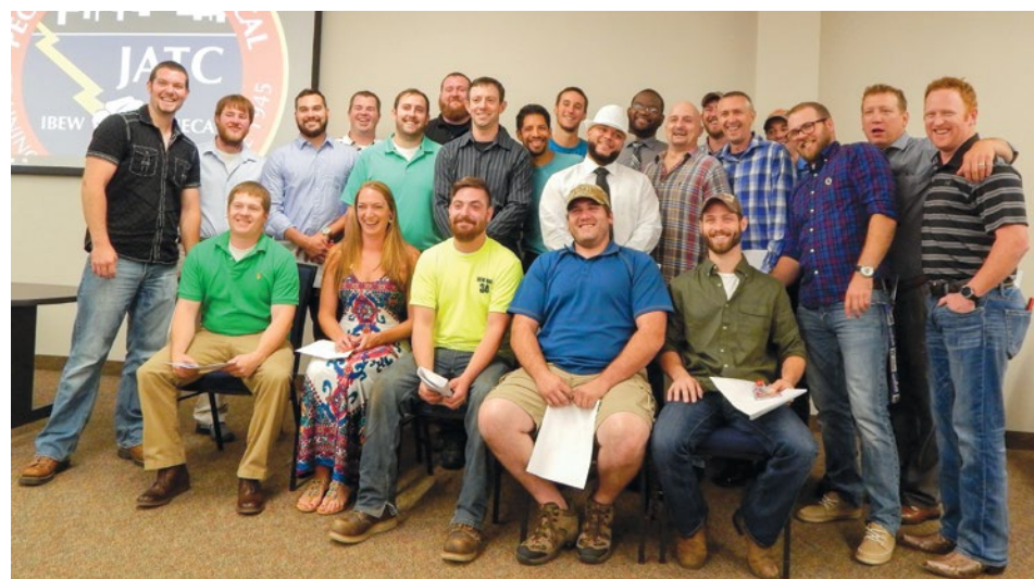
IBEW Local 34 class of 2017 inside apprenticeship graduates.