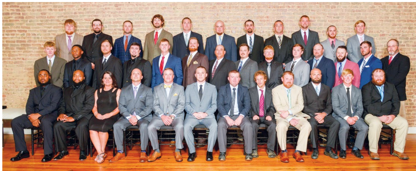
Local 558 congratulates class of 2017 apprenticeship graduates.

We thank everyone for their assistance with this event and look forward to celebrating our 100th anniversary next year.