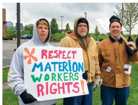
IBEW officers and members from multiple Ohio local unions joined informational picket in support of workers at Materion Corp.