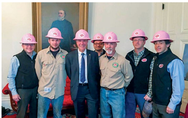
IBEW Local 300 members and management personnel from Burlington Electric Department, with Vermont Gov. Phil Scott (third from left) stand in recognition of "Electric Utility Lineworker Appreciation Day."