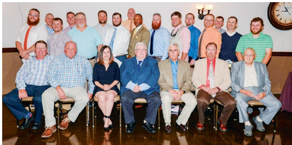
IBEW Local 760 and the ETAK congratulate the class of 2017 apprenticeship graduates.

Congratulations to all on the success of the